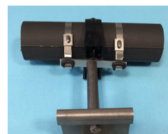
shows CLAMP-RA114-P02* for illustration